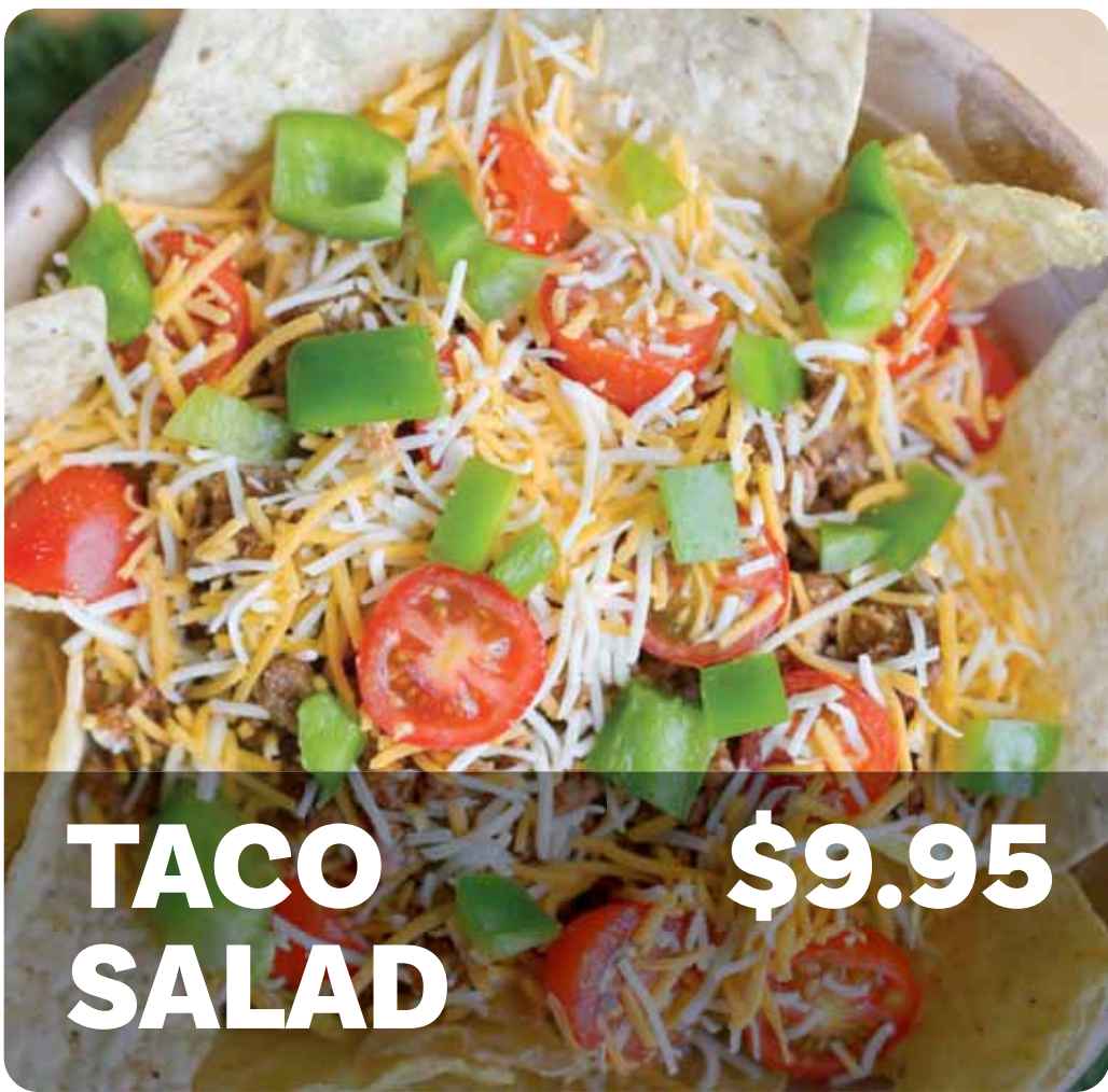
TACO SALAD $9.95