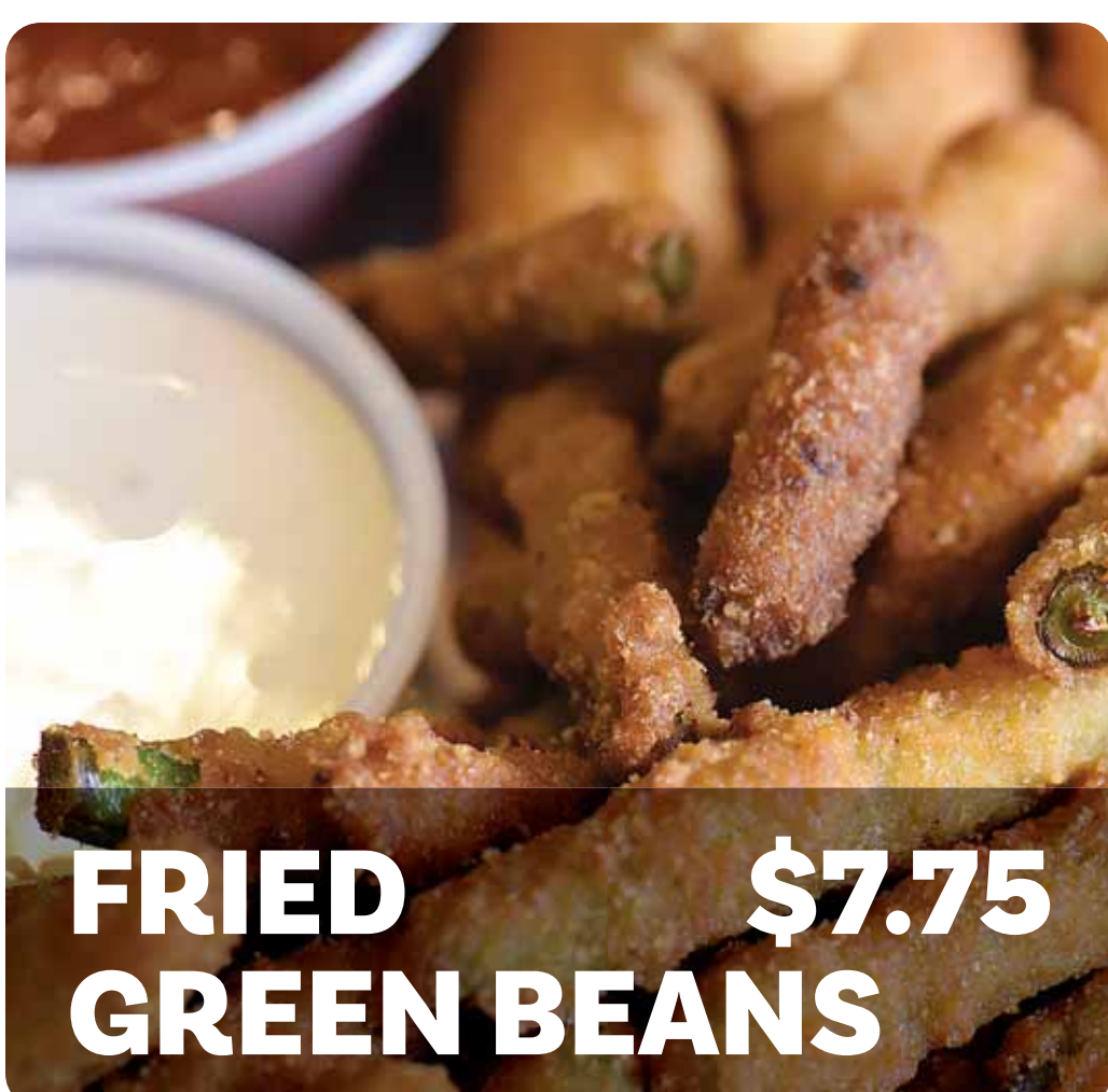
FRIED GREEN BEANS $7.75