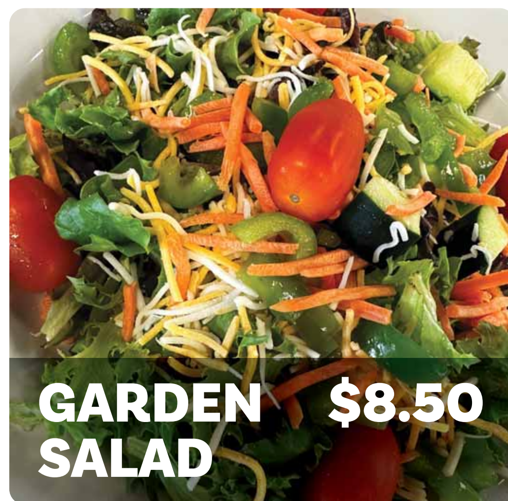
GARDEN SALAD $8.50