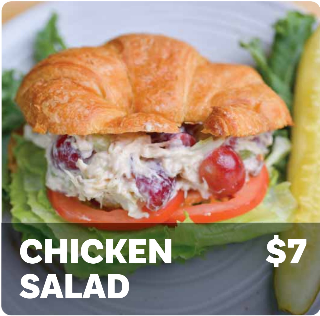
CHICKEN SALAD $7