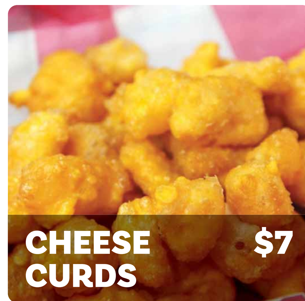
CHEESE CURDS $7