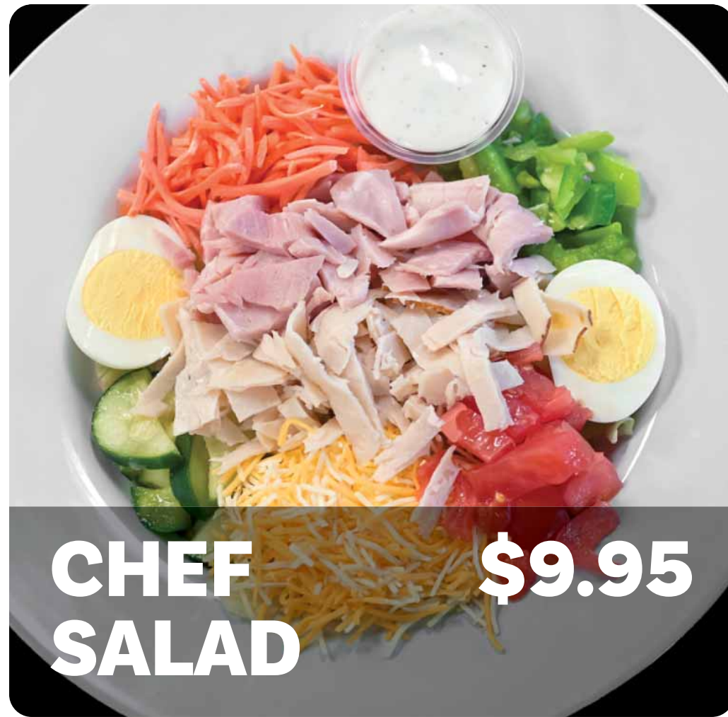
CHEF SALAD $9.95