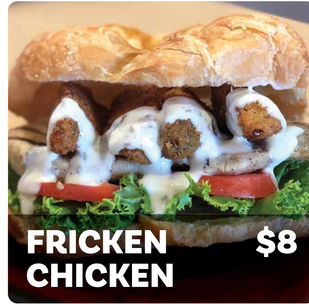
FRICKEN CHICKEN $8