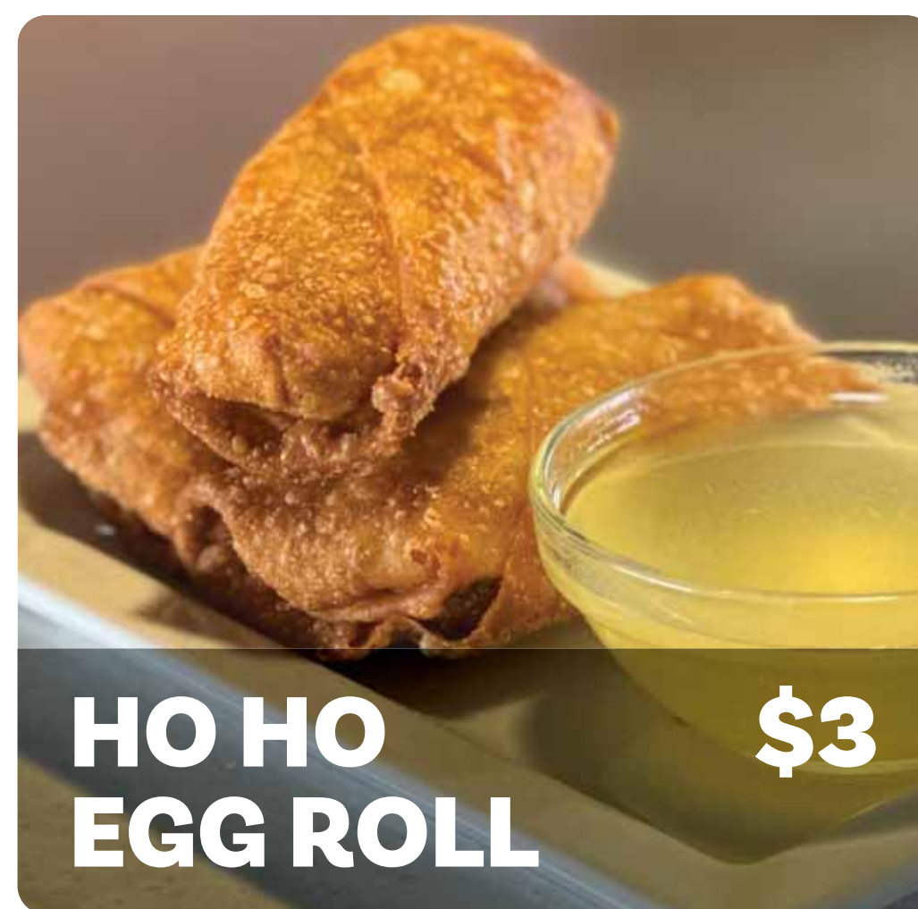
HO HO EGG ROLL $3