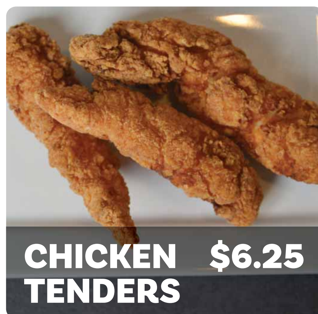
CHICKEN TENDERS $6.25