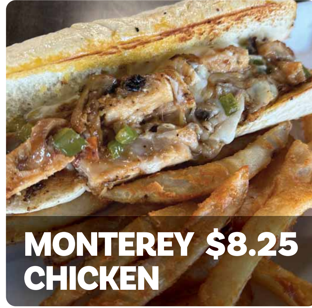
MONTEREY CHICKEN $8.25