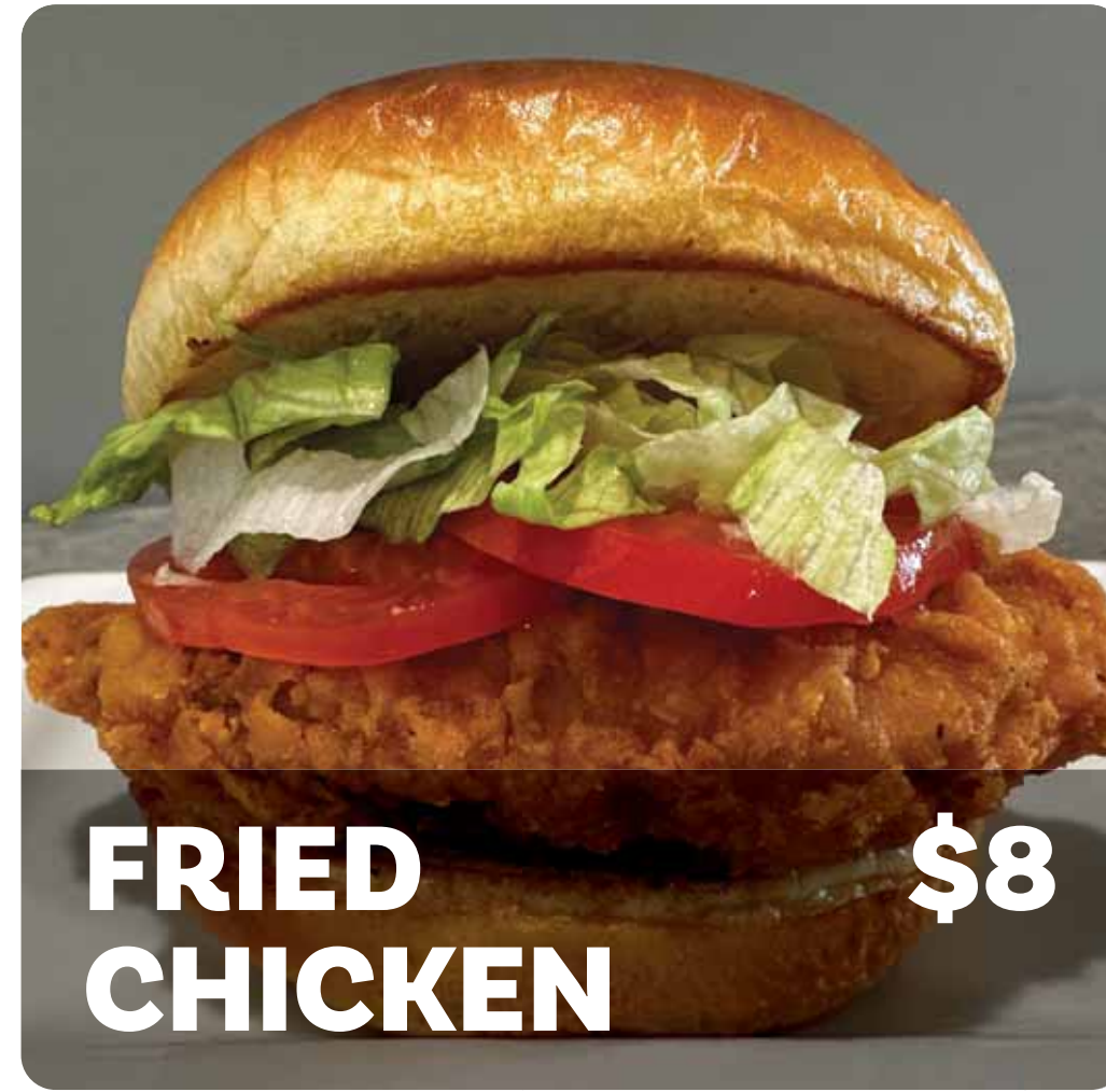
FRIED CHICKEN $8