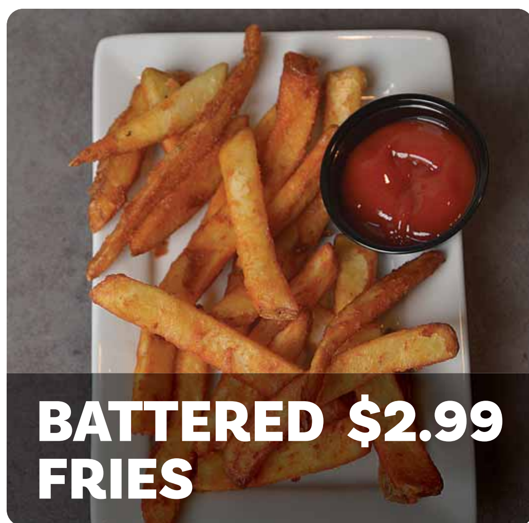
BATTERED FRIES $2.99