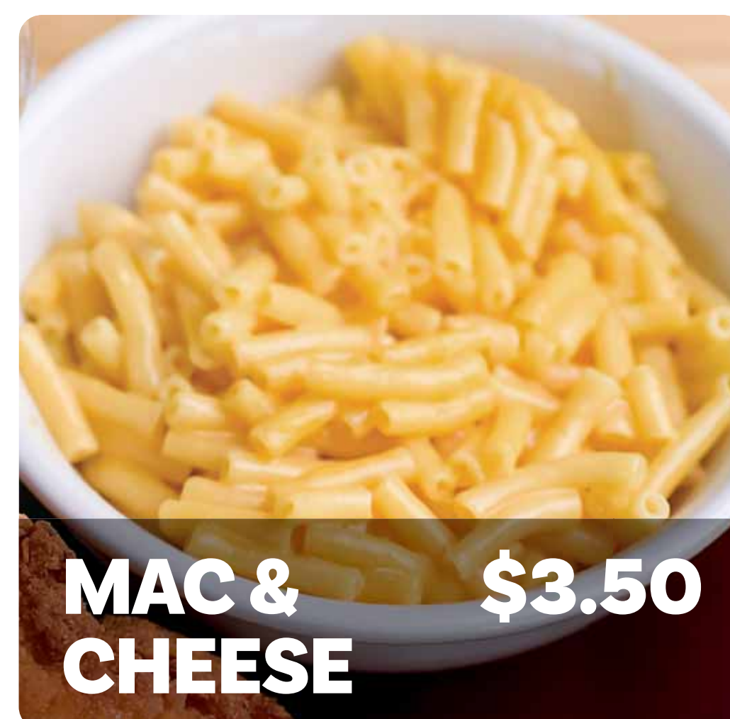
MAC & CHEESE $3.50