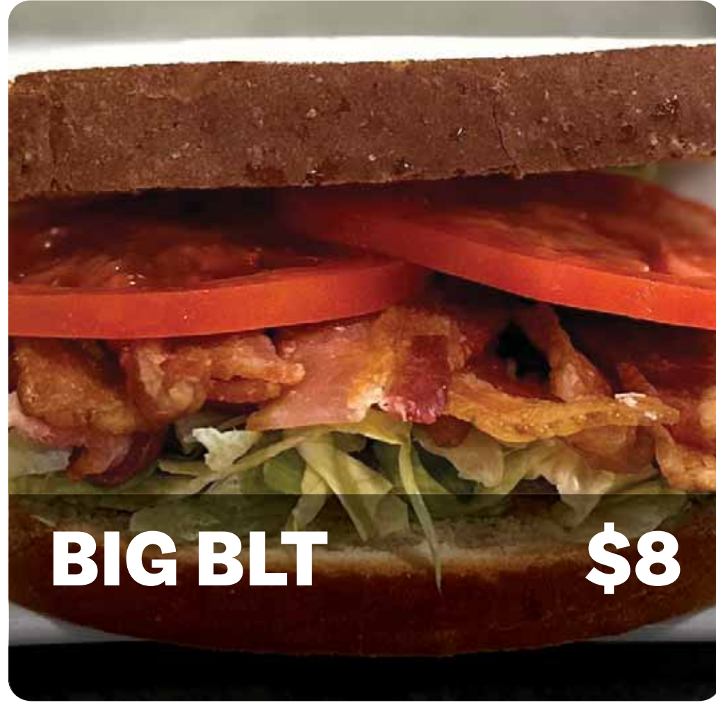
BIG BLT $8