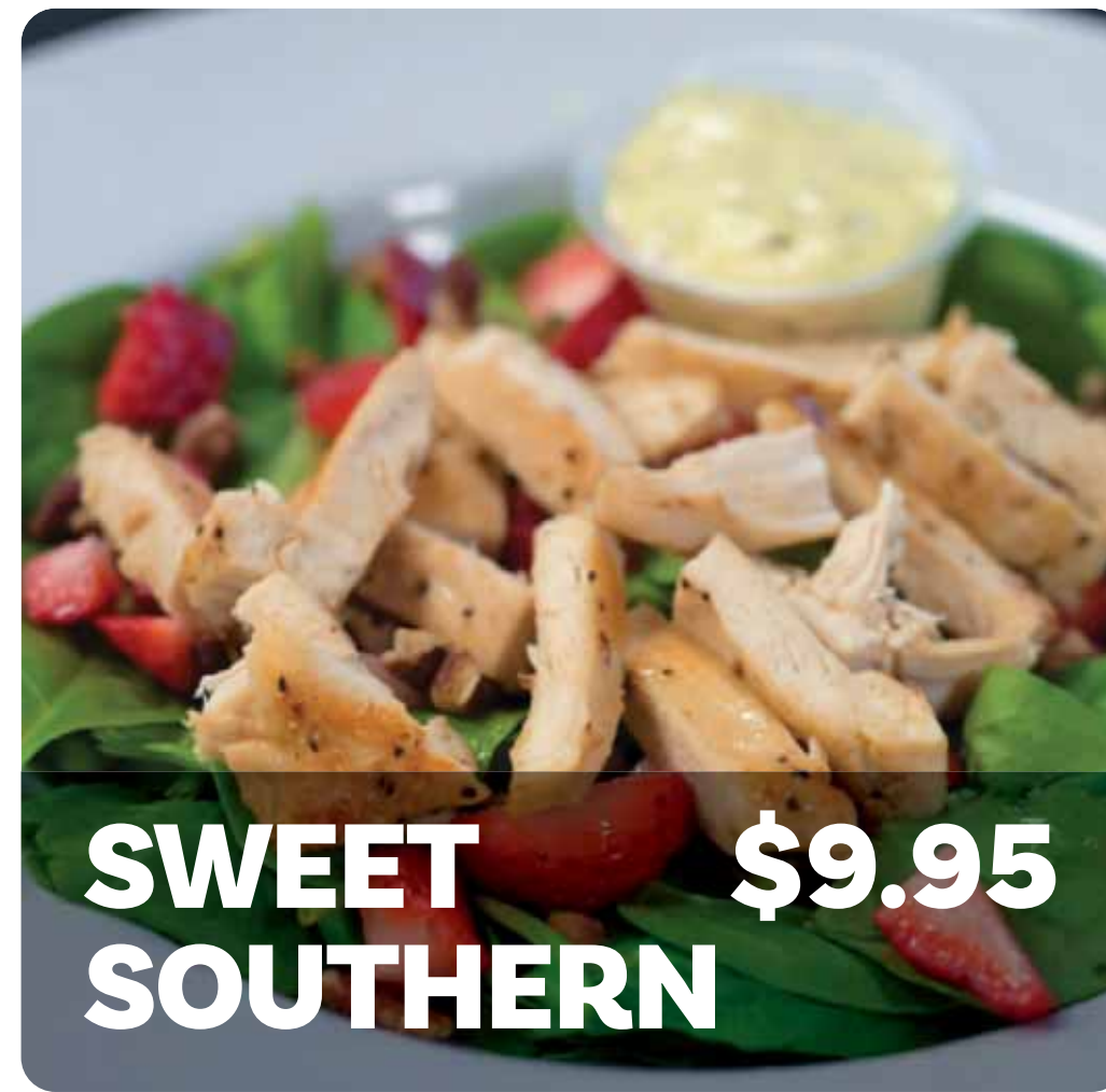
SWEET SOUTHERN $9.95