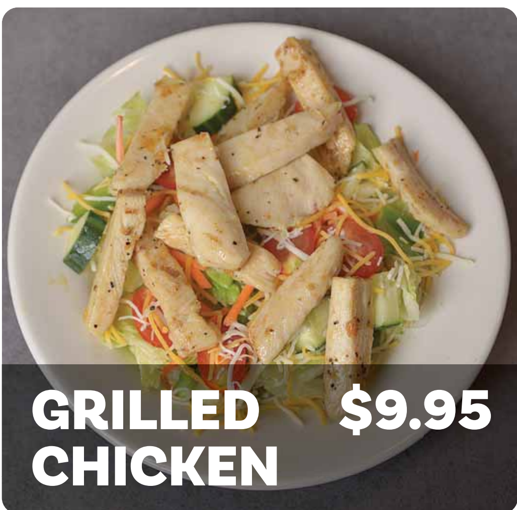
GRILLED CHICKEN $9.95