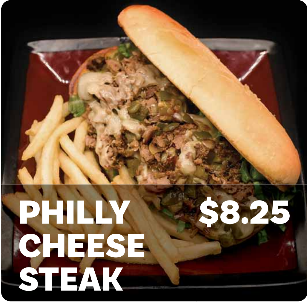
PHILLY CHEESE STEAK $8.25