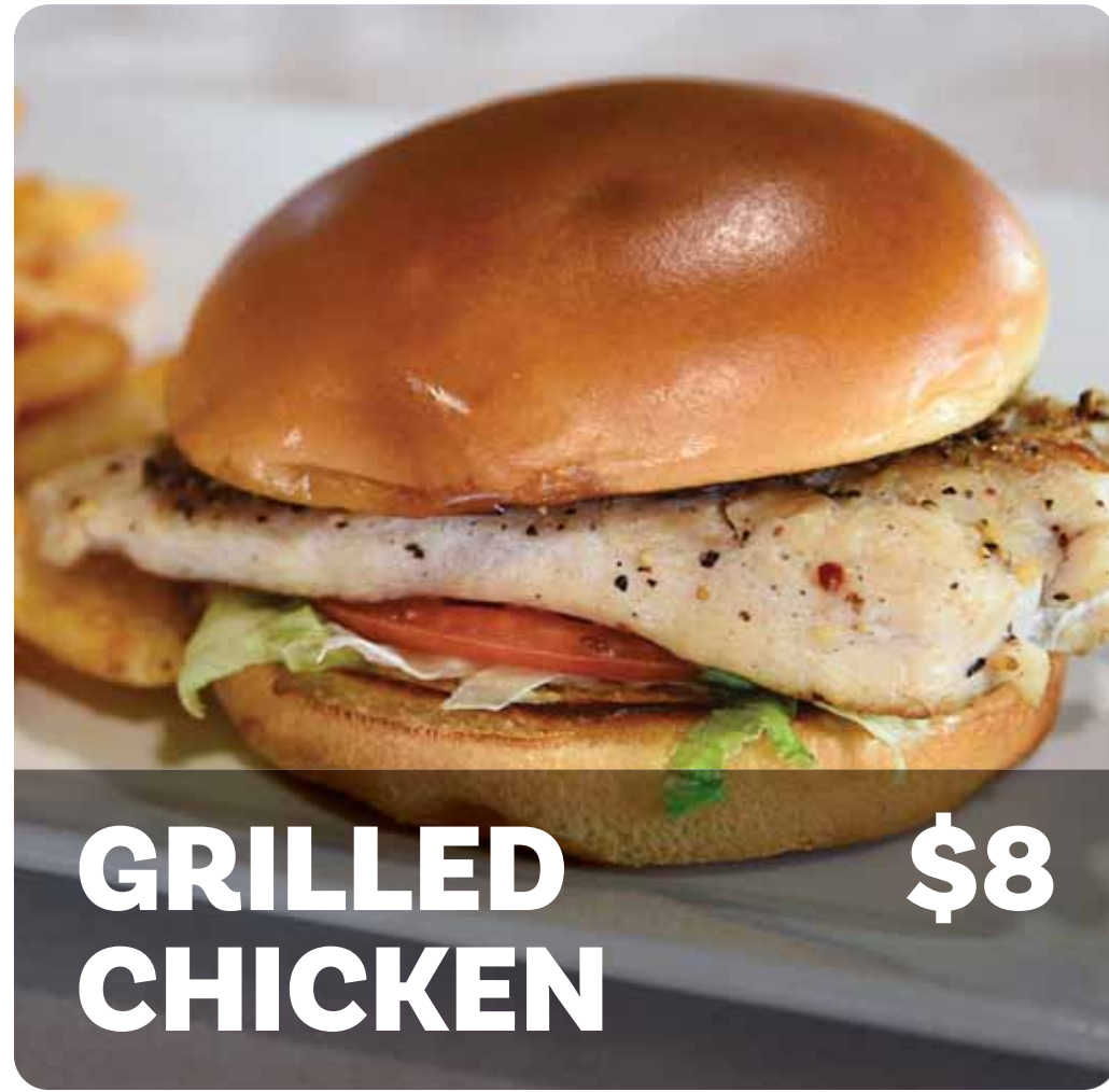
GRILLED CHICKEN $8