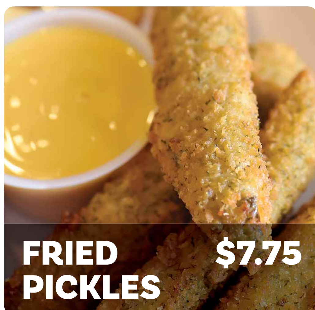
FRIED PICKLES $7.75