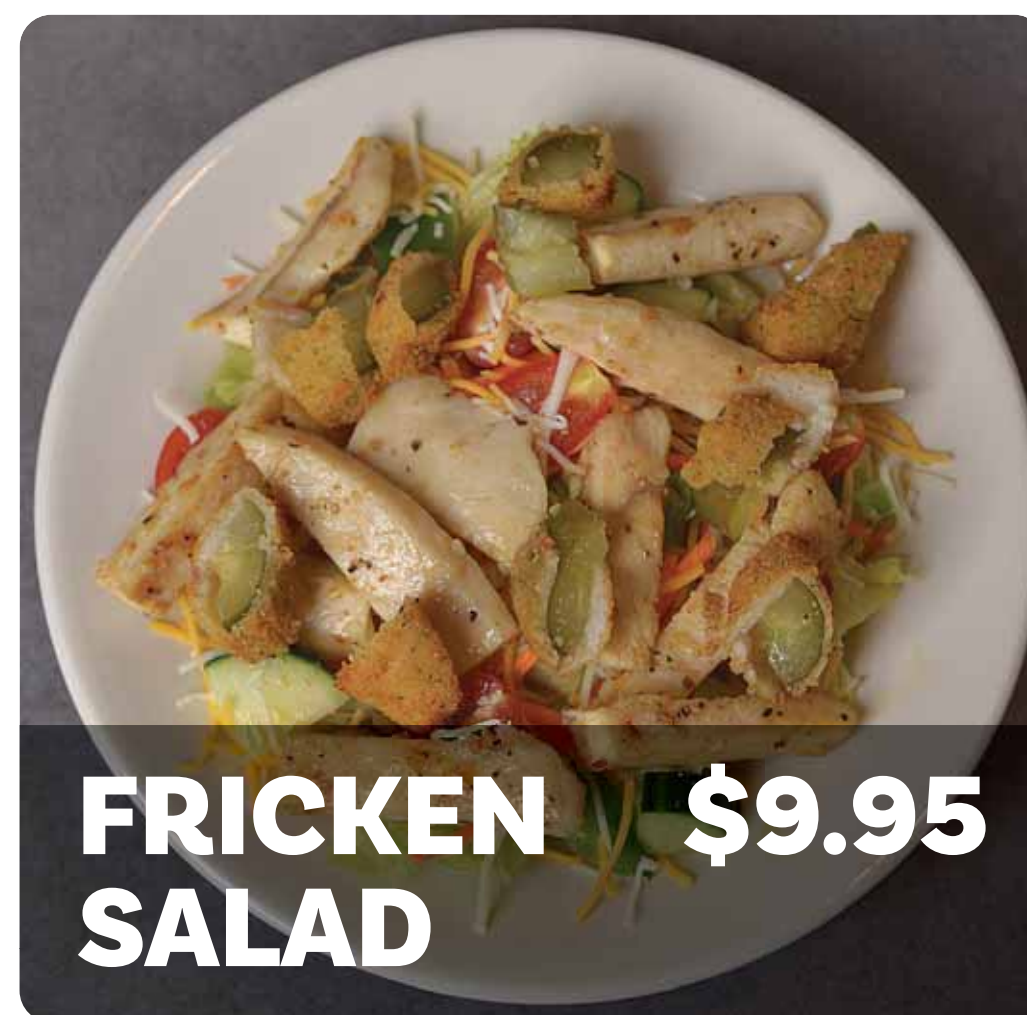
FRICKEN SALAD $9.95

DRESSINGS RANCH, ITALIAN CHIPOTLE RANCH LIGHT RANCH HONEY MUSTARD BALSAMIC POPPY SEED RASPBERRY VIN. THOUSAND ISLAND