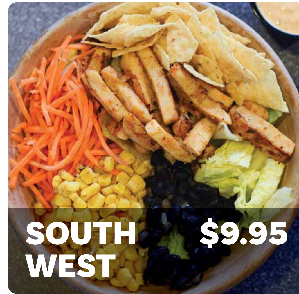
SOUTH WEST $9.95