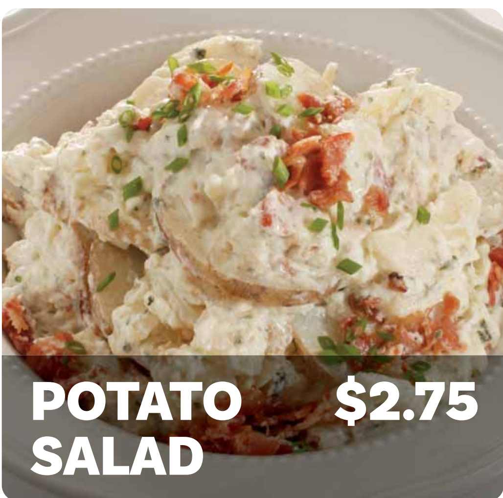
POTATO SALAD $2.75